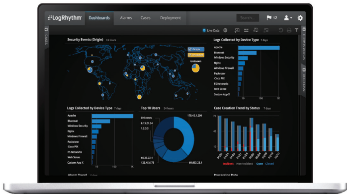
Figure 4-1: Sample security intelligence and analytics dashboard.

In the context of threat management and security intelligence and analytics, a dashboard is a SIEM tool that brings together several security analytics views on one screen. Instead of having to manually run several reports and flip among their results, a person can use a dashboard that automatically runs and refreshes a set of reports, displaying the results in or near real time in a convenient layout. Figure 4-1 shows an example of a security intelligence and analytics dashboard.